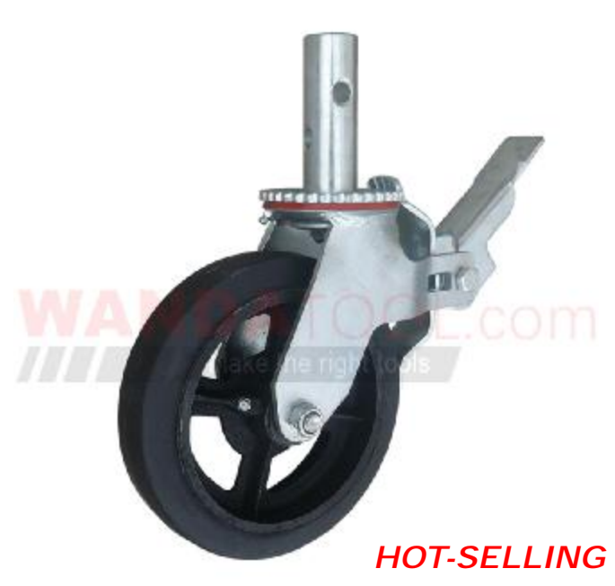
Formed rig is stronger than welded design!